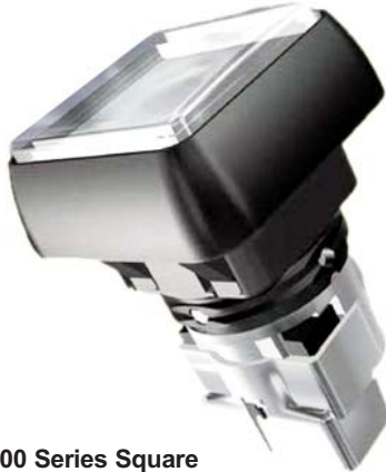
Gamesman 300 Series Square

Button can be fitted fully assembled saving on production time. Lamp or LED illumination