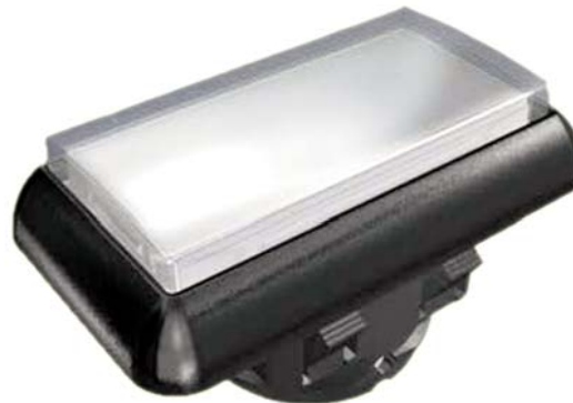
Gamesman 500 Series Rectangular