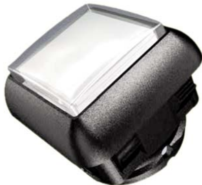
Gamesman 500 Series Square