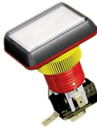
Gamesman 300 Series Rectangular